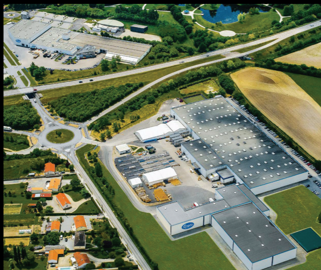
4 Kinedo sites over 570,000ft 2